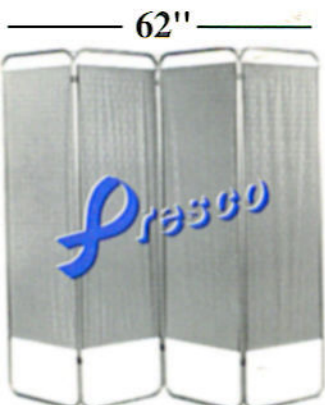
An Excellent Choice