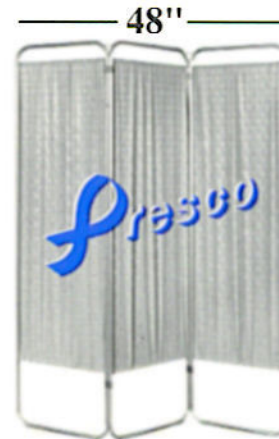
Economical and requires less space